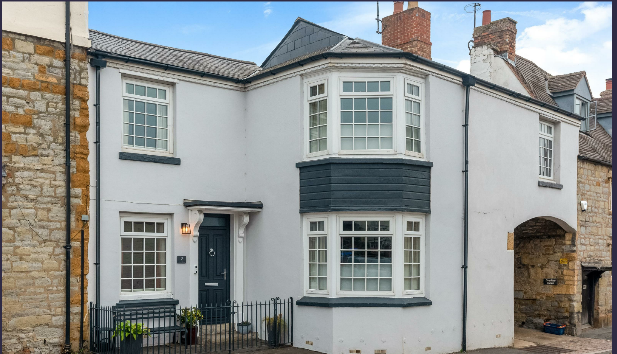
2 Church Street, Shipston-on-Stour, CV36 4AP